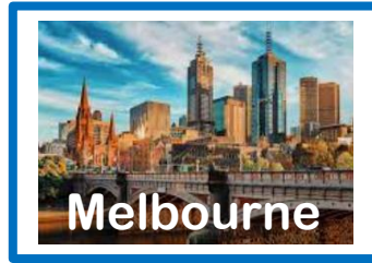
Somewhere I would like to visit