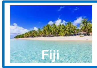
Somewhere I would like to visit